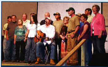
Songwriters Festival 2012

There's a quaint community in Coosa County that offers a dinner theatre with shows, hosts the Southeastern Songwriters Festival and features four show-