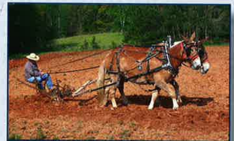
Annual Mule Day will be held on April 20, 2013.

Browse their website, www.weogufkacenter.com , for their calendar of events and take a ride to this delightful community for some live entertainment.